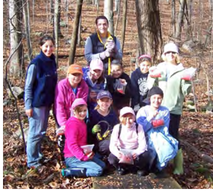
Girl Scout Troop 50567

Ridgefield – This past fall, Ridgefield Girl Scout Troop 50567 signed up to be monitors of the section of the Norwalk River which runs through Aldrich Park. They are focusing particularly on removing invasive Japanese barberry and winged euonymus shrubs from the park. This spring they will be planting native trees and shrubs to replace the invasive shrubs they removed in order to improve habitat and biodiversity in the Park. The troop will earn their bronze badge at the end of the project.