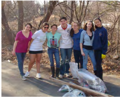
Weston H.S. Green Club

Georgetown-Cannondale –The Green Club at Weston High School has signed up to be the monitor of the section of the Norwalk River from the junction of Rt. 107 and 57 in Georgetown to Seeley Road near Cannondale.