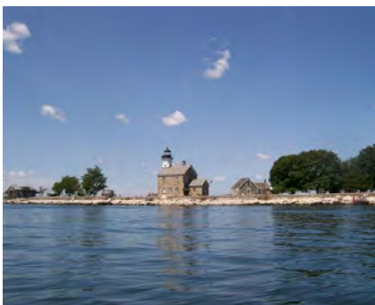
Lighthouse at Sheffield Island