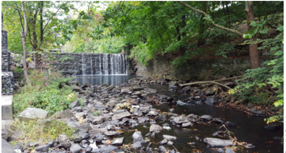
Flock Process Dam before...